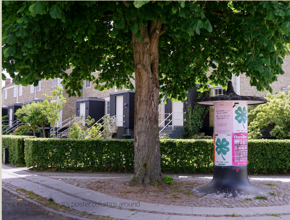
Spot Knud Engelhardt's poster columns around the municipality.